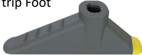
Anti trip Foot

Improved Firmus barrier with strengthened spigot and removable foot