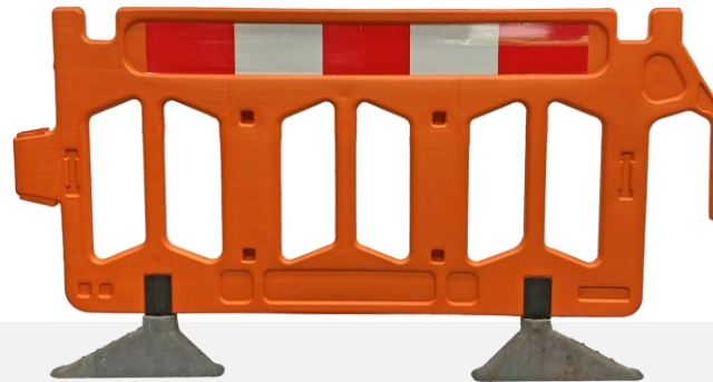
Heavier, compact, anti trip foot