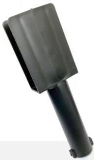
Stronger removable Pin