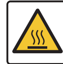
Danger Hot exhaust