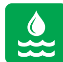
Cw Check Water daily