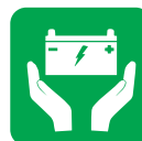
Bc Battery Care