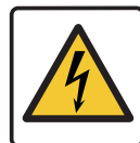
Danger Electric shock