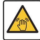
HAV Hand Arm Vibration