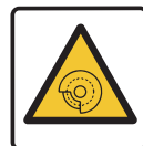
Caution Abrasive Wheel