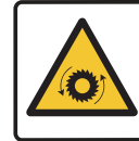
Danger Rotating blade