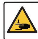
Caution Finger trap