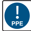
Correct PPE must be worn

Clearly marked minimum PPE will be visible on all equipment,